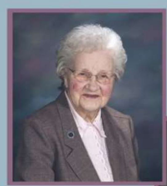
Born: December 27, 1921 Professed: July 11, 1943 Died: June 30, 2020

In 1938 she entered the Scholasticate at St. Benedict's in St. Joseph, MN. After attending high school at St. Benedict's Academy, she graduated from the College of St. Catherine. She continued her studies at the College of St. Benedict, the College of St. Benedict, the College of St. Catherine, Moorhead State College and Ball State University. After her first vows in 1943, she began her teaching ministry at St. Mary's in St. Cloud, MN, followed by