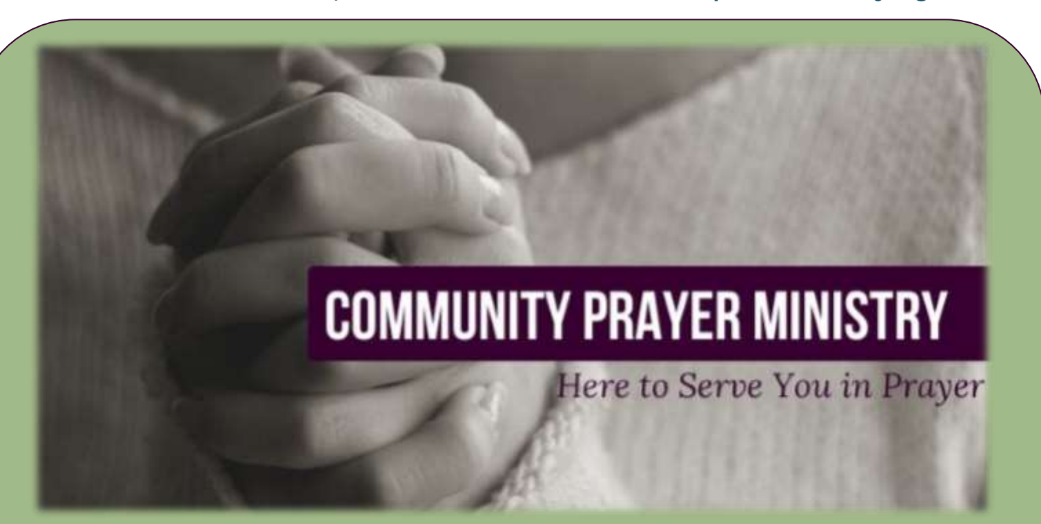
We Would Love to Hear from You

For further information, call 651-777-8181 or visit us www.stpaulsmonastery.org.