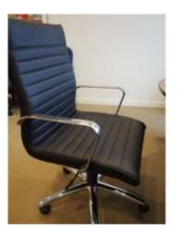
Sample of the new conference chairs from our friends at SOS Office Furniture

Would you help us make St. Paul's Monastery a more comfortable and inviting space for our guests? As part of our Benedictine ministry, we welcome all guests as Christ. This welcome includes not only an invitation into our monastery for support and spiritual instruction, but also physical comfort.